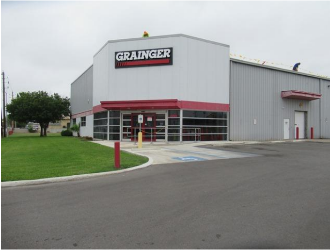
Exterior Elevation Overview