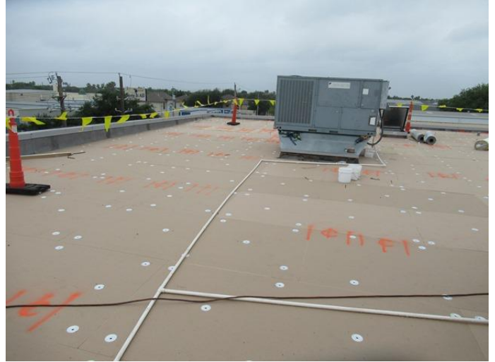
New TPO / Insulation Installation Overview