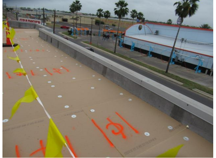
Existing Flashing / Metal Coping Not Removed