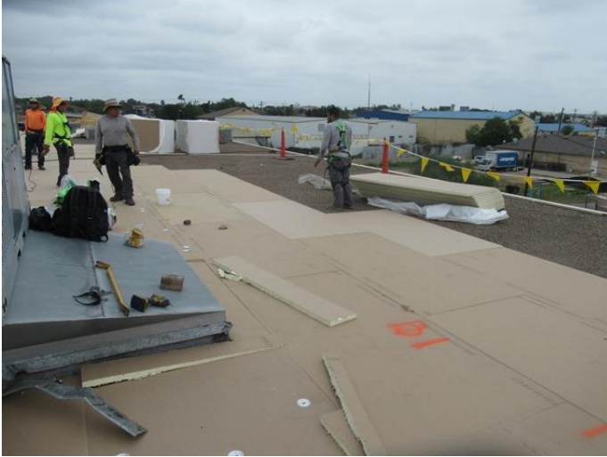
New TPO / Insulation Installation Overview