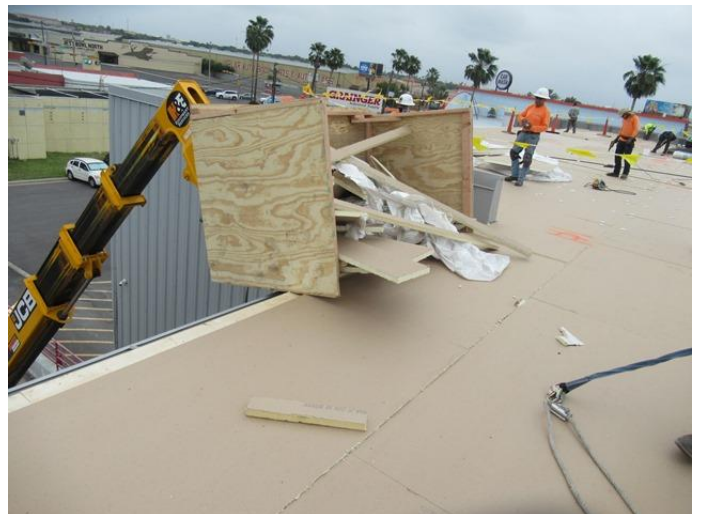
Debris Removal Process