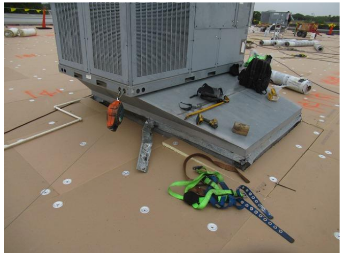
Existing Flashing / Counter Flashing Not Removed Low Flashing Height also Depicted