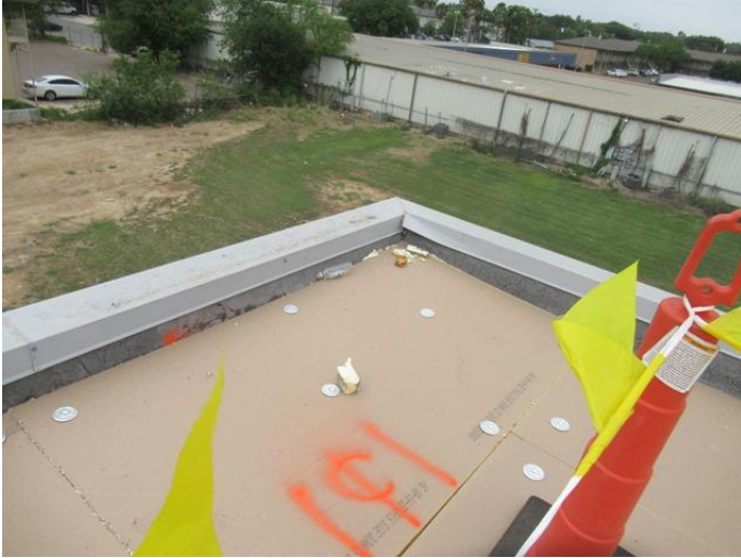
Existing Flashing / Metal Coping Not Removed