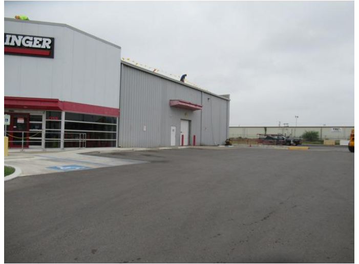
Exterior Elevation Overview