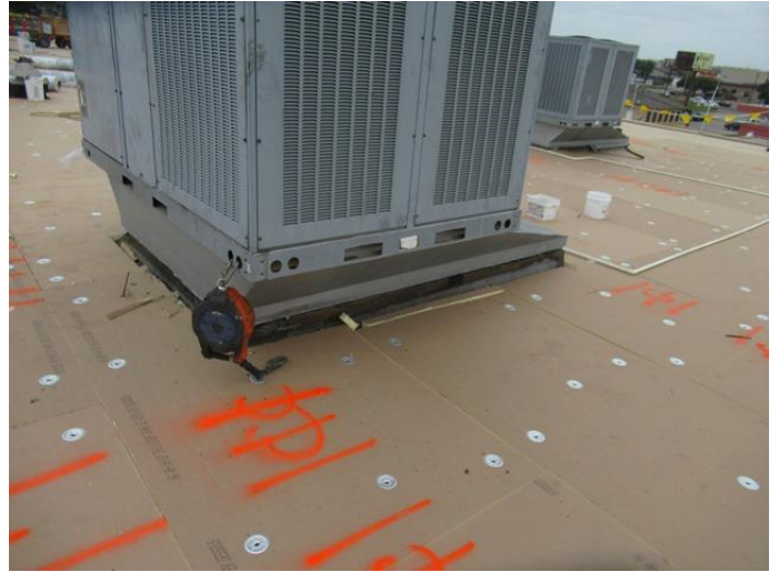
Existing Flashing / Counter Flashing Not Removed Low Flashing Height also Depicted