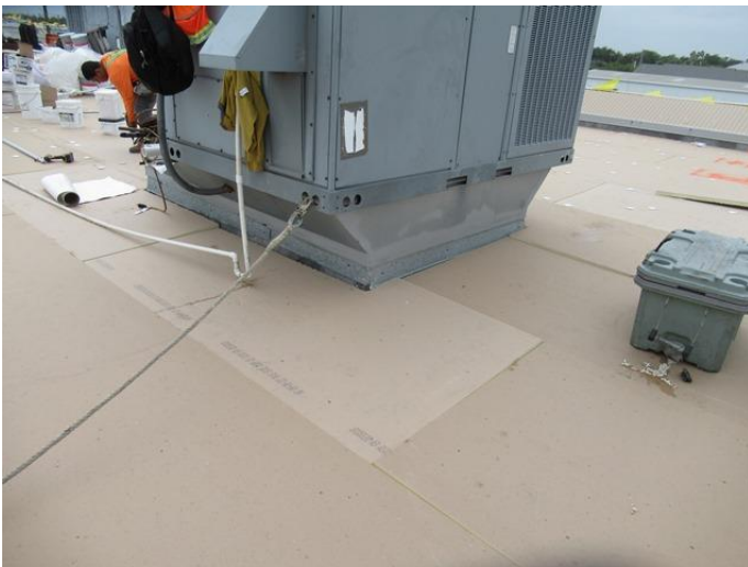
Existing Flashing / Counter Flashing Not Removed