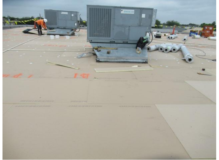
New TPO / Insulation Installation Overview