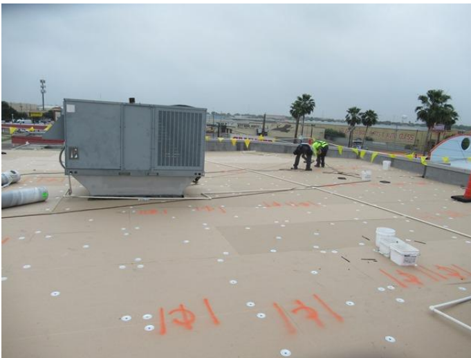
New TPO / Insulation Installation Overview