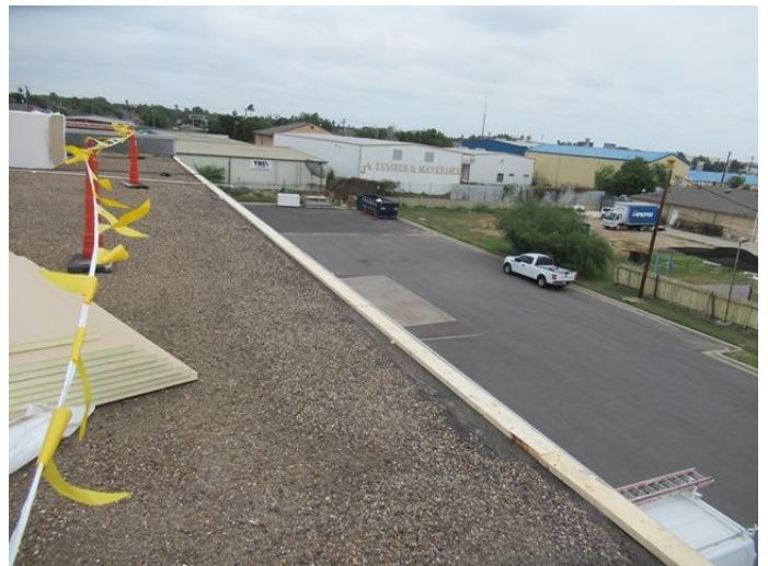
New TPO / Wood Nailers Installation Overview