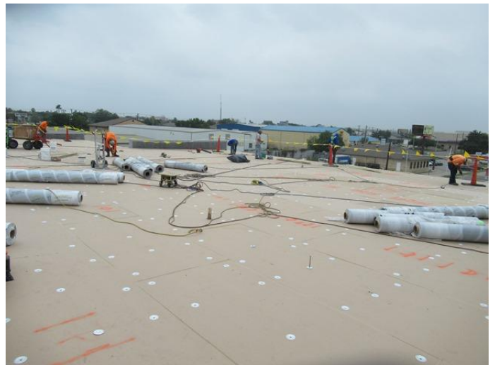
New TPO / Insulation Installation Overview