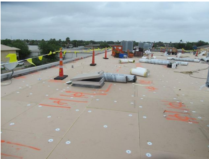
New TPO / Insulation Installation Overview