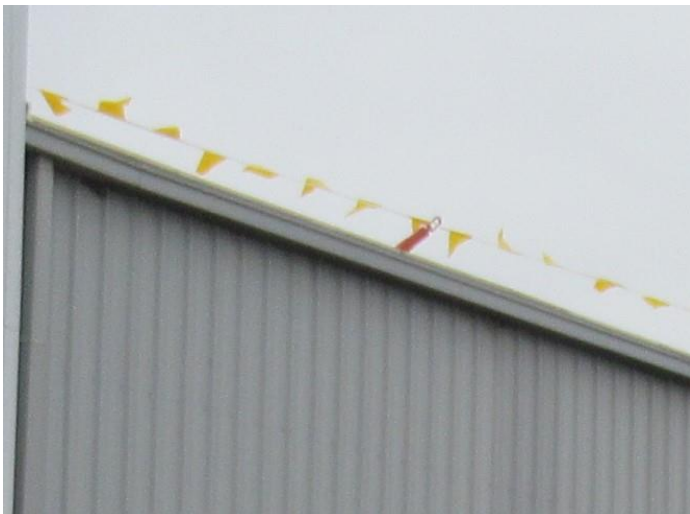
Existing Perimeter Edging / Gutter System Not Removed