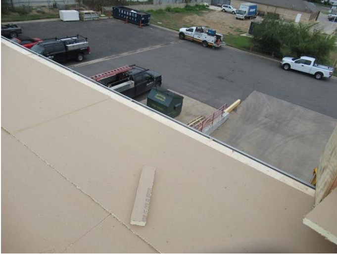
New TPO / Wood Nailers Installation Overview