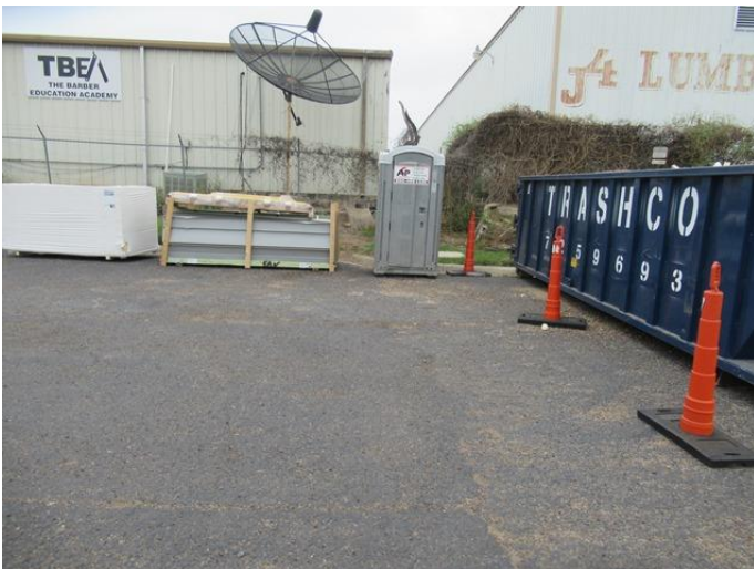
Staging Area Overview